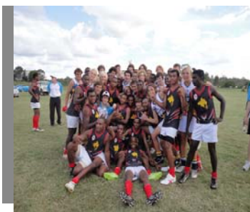
Under 16 Binatangs in Queensland

THE UNDER 16 Coca Cola Binatang side has returned from a brave campaign in Queensland.