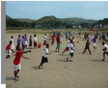
Juniors Having a Kick

With a long season ahead, the involvement and development of the participants is the greatest challenge.