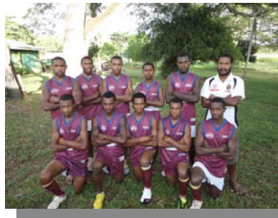
Academy Boys 2010