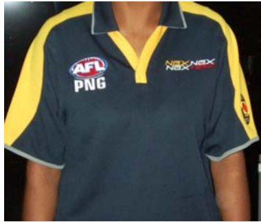
AFLPNG POLO SHIRTS - K100.00 MENS AND WOMENS AVAILABLE

E-Mail: aflpng@global.net.pg aflpnginfo@gmail.com